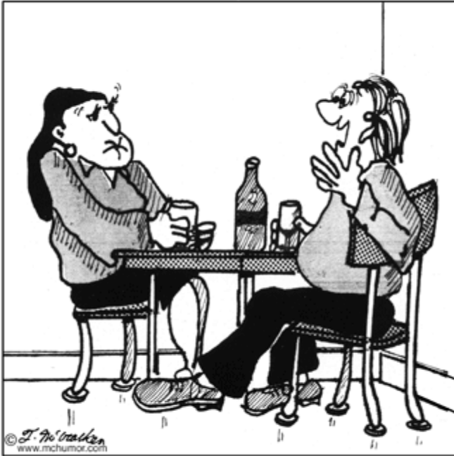
"So, what do you think of my first attempt at making homemade beer?"