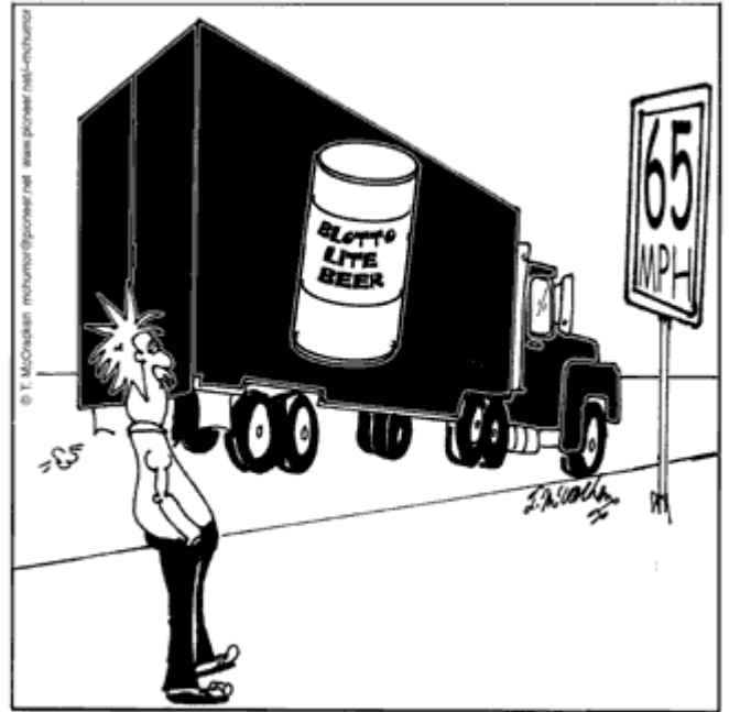
Einstein discovers that the speed of light it is 186,000 miles per second, but the speed of Lite beer is only 65 MPH.